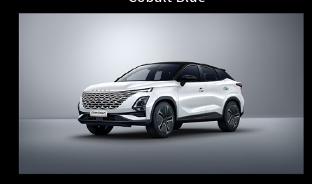
Obsidian Black roof with Selenite White body