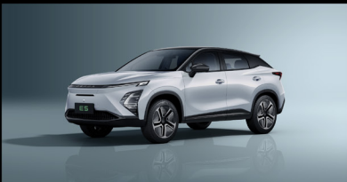
Obsidian Black roof with Selenite White body