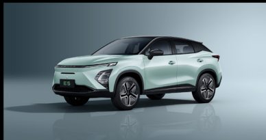
Obsidian Black roof with Jade Green body