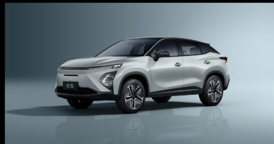
Obsidian Black roof with Galena Silver body